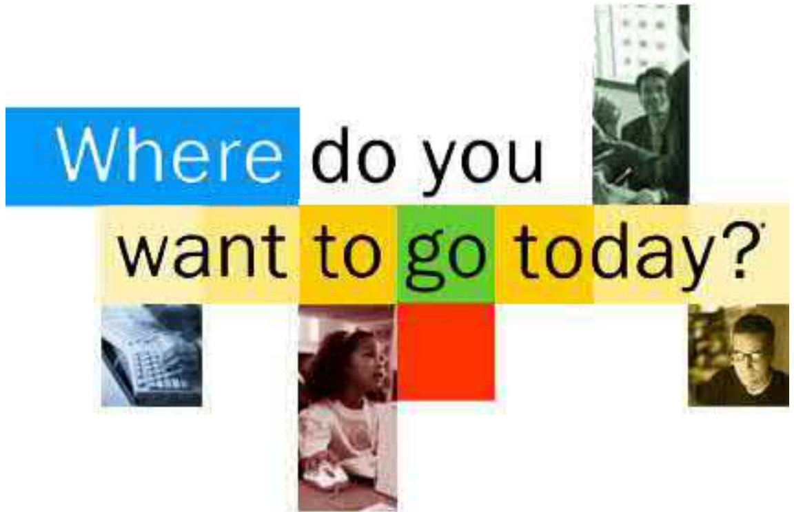
Microsoft campaign, 1994